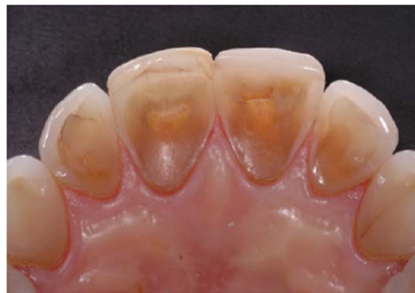
Fig. 6: Extreme erosion of palatal sides in four maxillary incisors in a bulimic patient, suffering from frequent regurgitations. Note the place of the dead tract by the production of tertiary dentin at pulp level in 11 and 21 as well as the peripheral enamel collaret in the proximal areas protected from a direct contact with the acid and in the sulcus due to the buffering role of the gingival fluid.

The remastication of refluxes aggravates wear lesions especially in the presence of dairy foods and vegetables inducing the