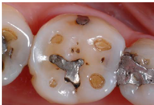
Fig. 4. Erosive component in a 70 year old patient presenting GERD related issues