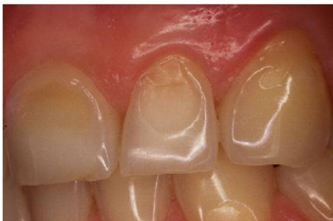
Fig. 5. Severe dental erosion in a young woman, aged 30, associated with the daily consumption of fresh lemon juice

locations are the palatal surfaces of the upper canines and central incisors, the vestibular surfaces of the upper incisors and canines as well as the vestibular surfaces of the lower premolars and the occlusal surfaces of the first lower molars (O'Brien 1994; Jaeggi et al 1999; Gans et al 2001). In the meantime, Milosevic et al (1994) describe in a study performed on 14 year old children erosions on the lingual and occlusal surfaces. Erosive wear seems to be dominant in children. Milwards et al believe that dental wear results from erosion with the exception of the incisive edges and the occlusal surfaces that make contact. The location and the severity of the erosion depend directly on the exposure to an acidic environment. Erosion affects surfaces that make firsthand contact with an erosive environment (Milosevic et al 1994; Jaeggi et al 1999). In children the dominant set of causes are exogenous (carbonated drinks – consumption of citrus) which explains the location of the lesions.